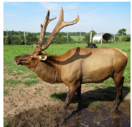
Left to Right -- Purple 1 shows good mothering care of her fawn purple 3 at 21 days of age. At 46 days Purple 3 enjoys chewing Aspen leaves off the branch. Elk 1 shows early signs of antler hardening as fall approaches.

Interested in supporting this continued research or just have a question