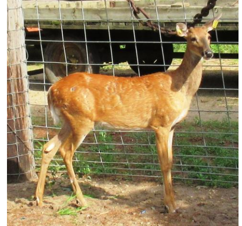
Left to Right – Red 1 , Purple 1 , Purple 2 (8-15-2019) buck fawn as of August 14 , 2020.

As the summer months give way to Fall's reduction of daylight we are reminded of the many changes that comes with the deer's hormone patterns and environmental conditions. Buck Red 1 is already changing into his fall hair coat as Purple 1 shows good body shape for the pending breeding season. We look to continue the vigilance of observations as the season changes bringing increased risks for exposures to stress from weather conditions, parasites, flies or bacterial organisms found around the farm which could impact your deer / elk health.